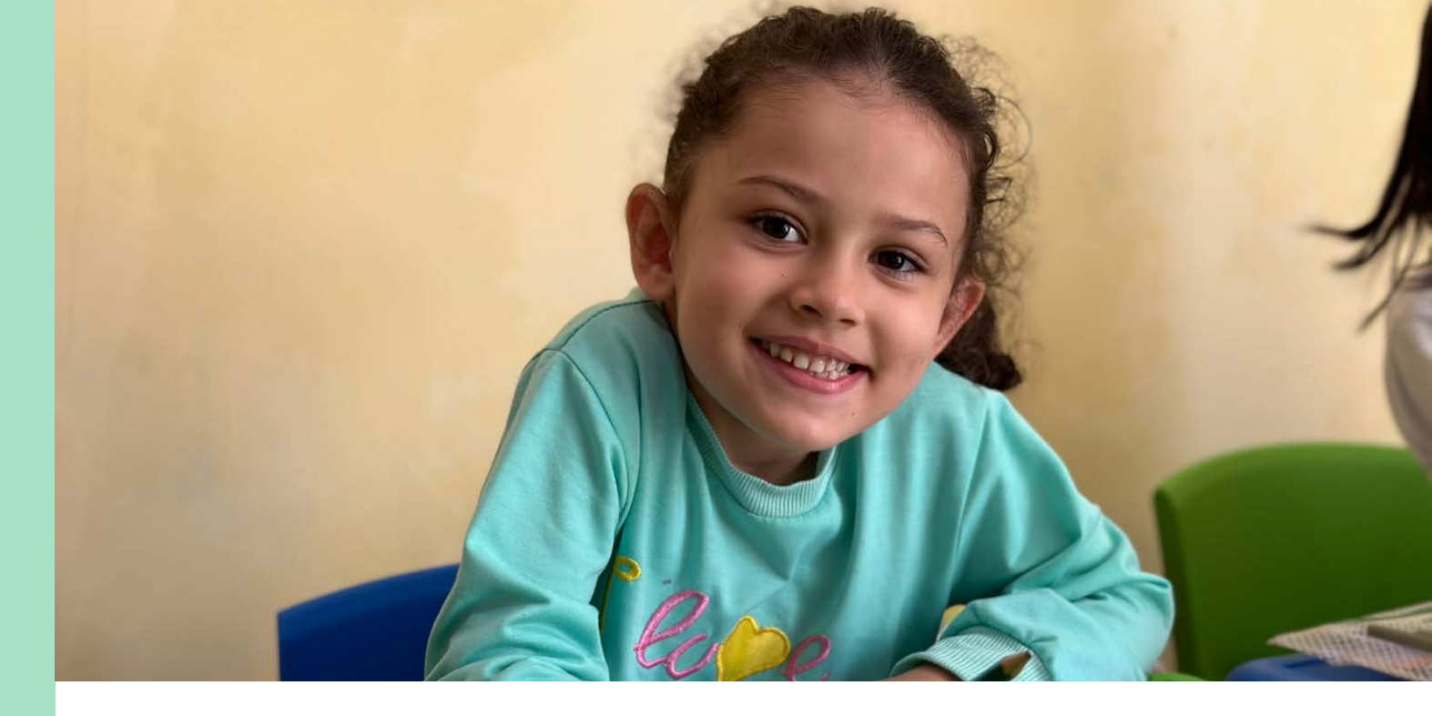
Above: A young pupil smiles on her first day at school at Care for the Displaced Children.