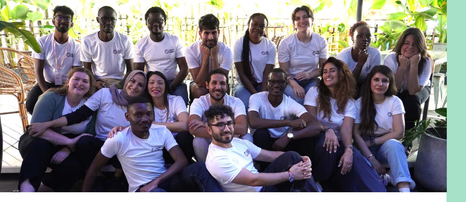
Above: RRLI implementation members and coalition member leaders at RRLI's inaugural retreat in Malaysia.