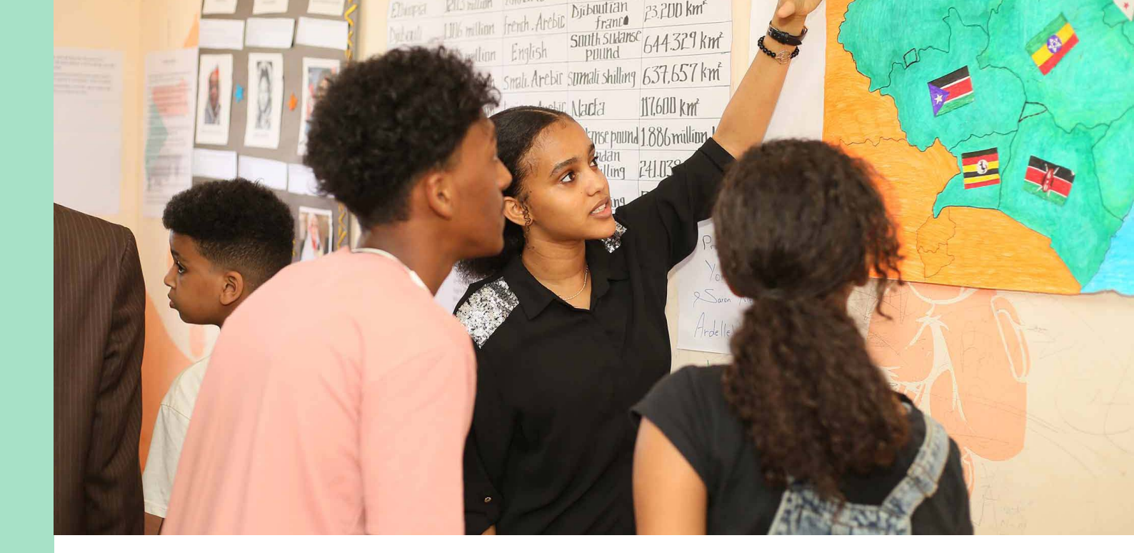
Above: Students from Tawasul Community School learning about countries in East Africa.