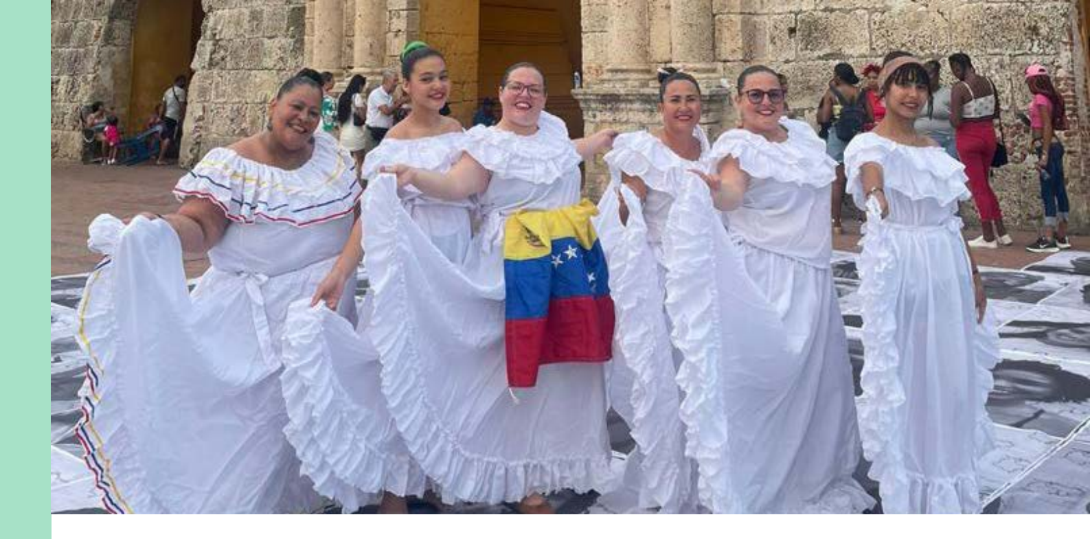
Above and opposite: a public advocacy campaign by El DANO for refugees' rights in Colombia. Photos by El DANO.