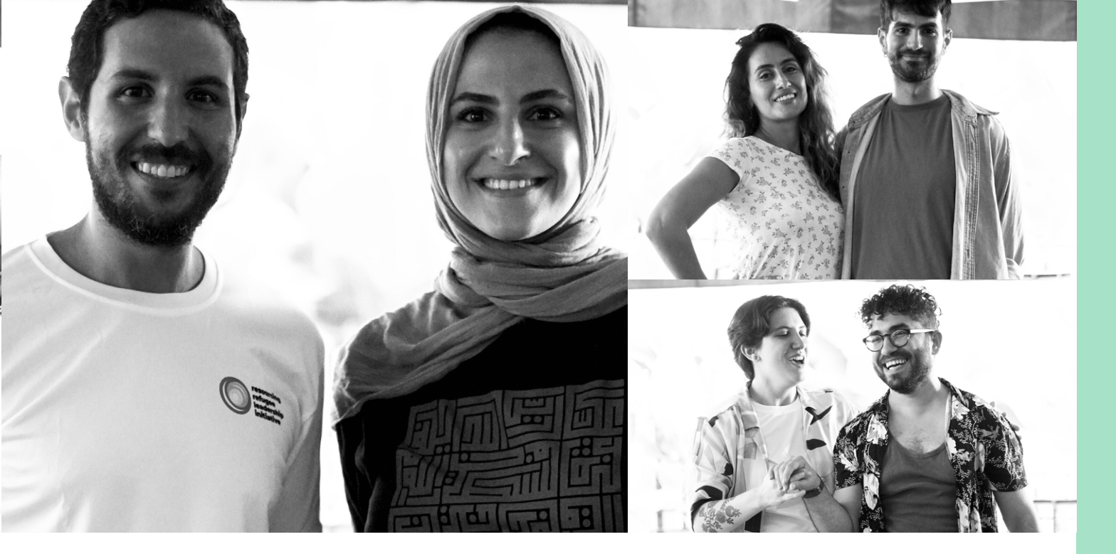
Above: Various leaders of the RRLI Coalition and RRLI implementation team.

is distinct because it is more organic. People often go to their neighborhood and their community when they face difficulties and require support. It is the first thing you often think of. It is fast, safe, and feels right. RLOs treat people with dignity and respect, have a better understanding of their needs, and are more accessible, representative, and accountable. RLOs support communities based on needs, rather than status and labels imposed by external actors. The range of support provided by RLOs is also holistic, from covering transportation expenses to attend a workshop or receive a service; to accompanying a mother to the hospital to deliver her baby; to assisting a family to pay their rent for the upcoming month; to paying the school fees for children who have not been able to access education in their home and host country. Unlike many international organizations, RLOs understand that needs are not homogeneous, making their impact unique, targeted, and long-lasting.