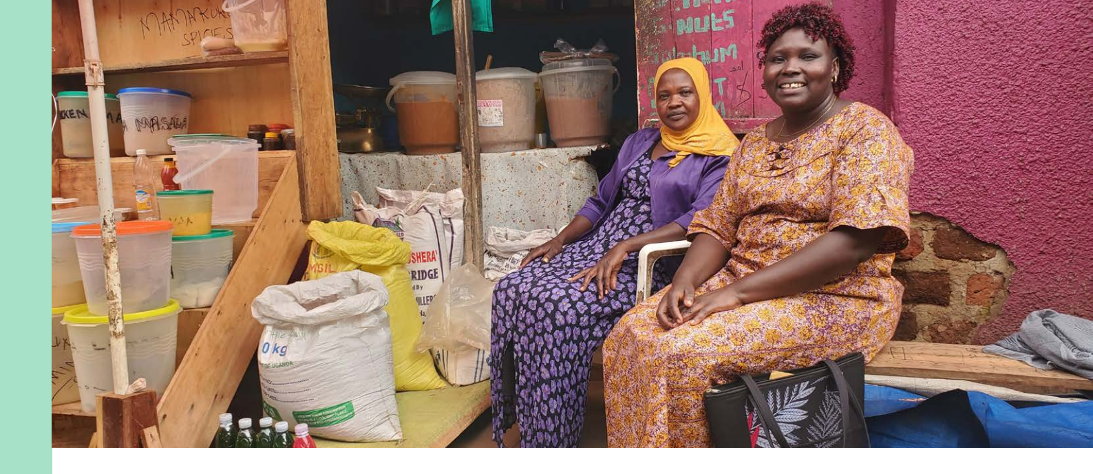
Above: A staff member from Kandaakiat (KOWED) (right) and woman entrepreneur (left) supported by Kandaakiat's seed capital.