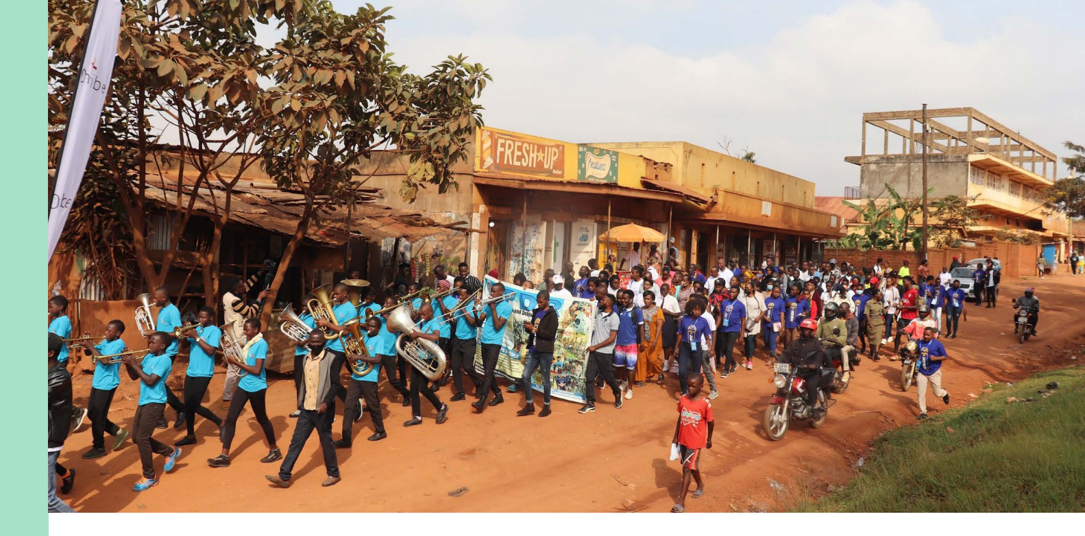
Above: Refugee-led organizations celebrating World Refugee Day in Uganda.

Opposite: An agroecology and business student receives her course completion certificate.