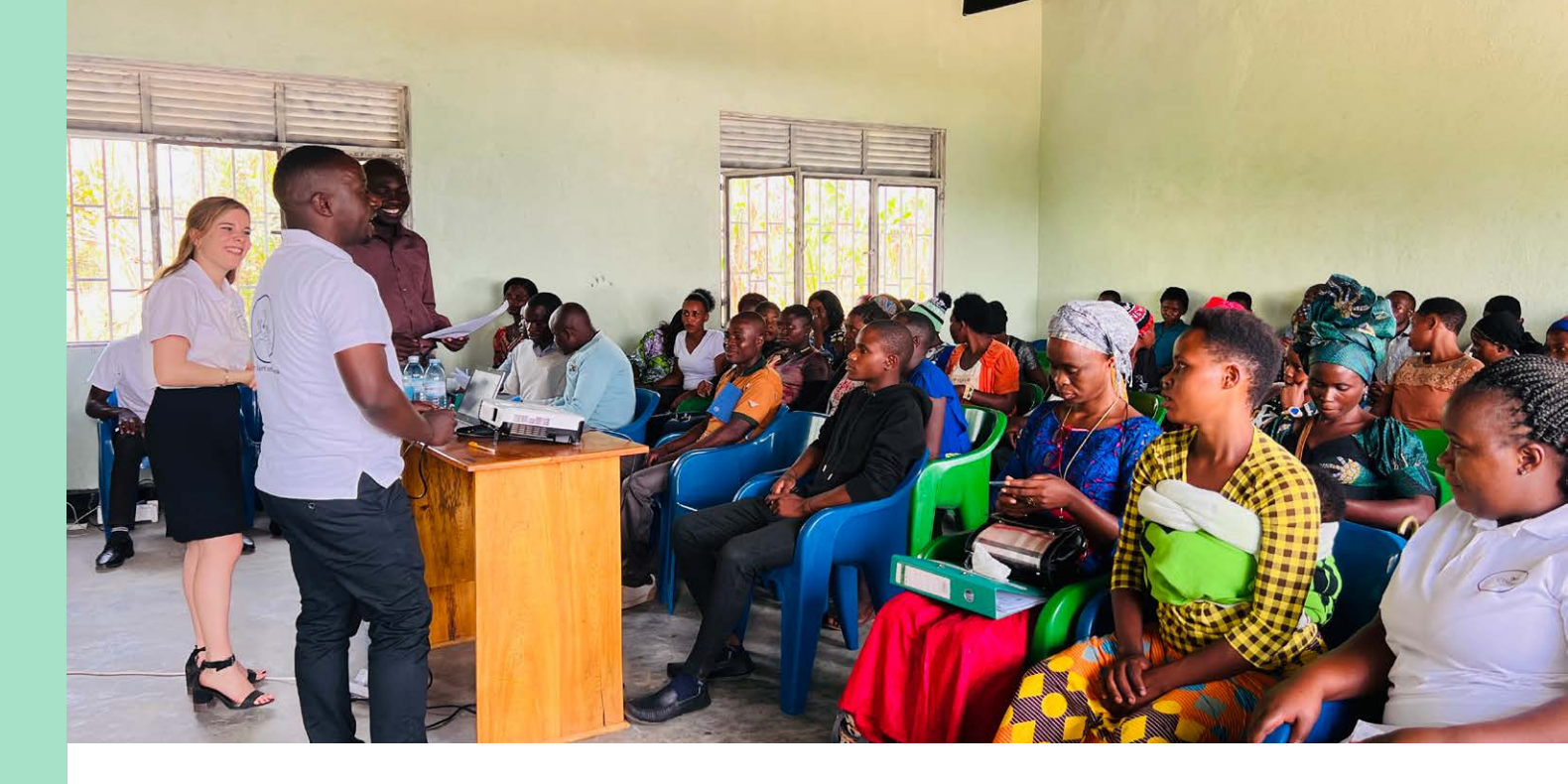
Above: An agroecology and business bootcamp hosted by grantee partner Tomorrow Vijana.